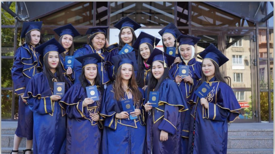
Nursing student during their graduation from 2021

The AccelEd project is co-funded by Erasmus + under Grant Agreement No. 618052-EPP-1-2020-1LT-EPPKA2-CBHE-SP